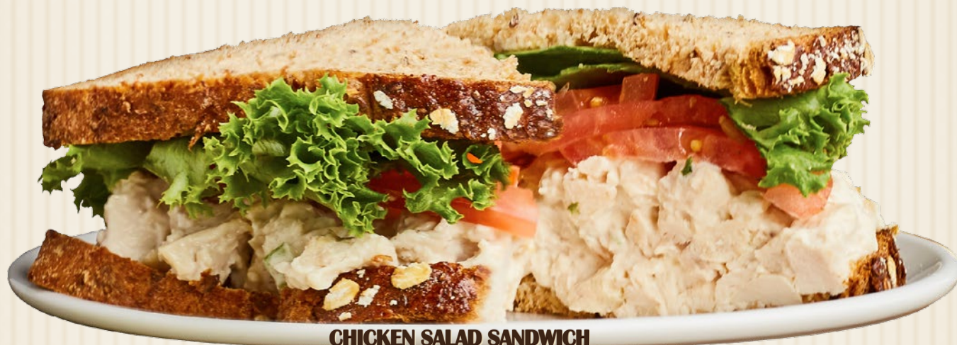
CHICKEN SALAD SANDWICH

USDA NY Strip Sirloin or Grilled Chicken with Swiss Cheese, Green & Red Peppers & Onions.