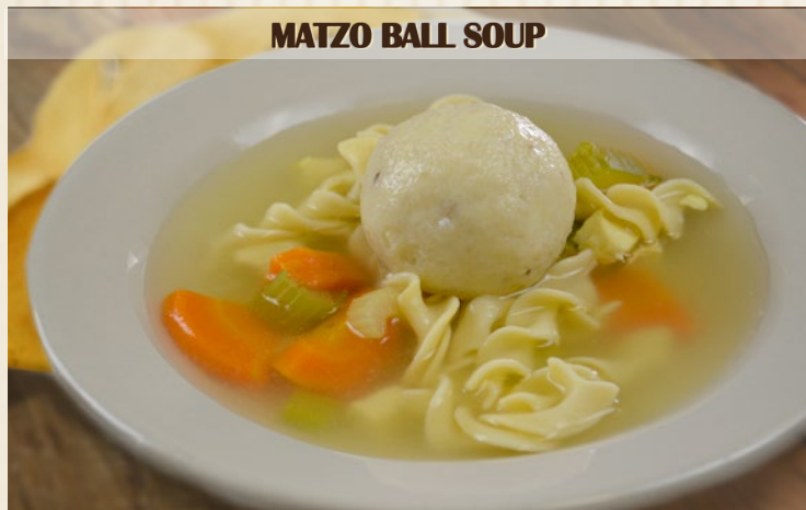
MATZO BALL SOUP

MONDAY | VEGETABLE TUESDAY | SPLIT PEA WEDNESDAY | BAKED POTATO THURSDAY | LENTIL FRIDAY | CLAM CHOWDER SATURDAY | FRENCH ONION SUNDAY | CHICKEN TORTILLA