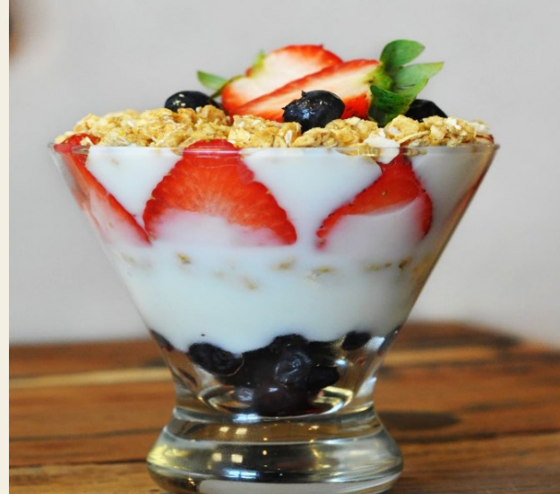
VANILLA YOGURT PARFAIT