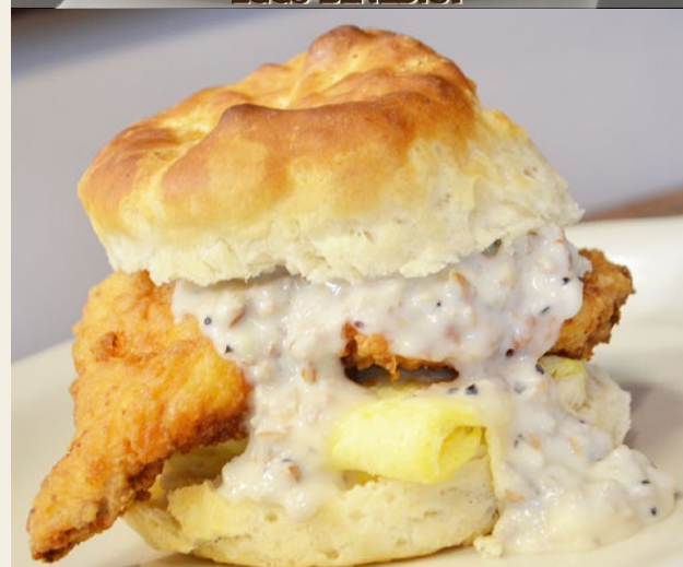
FRIED CHICKEN BISCUIT