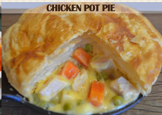
CHICKEN POT PIE